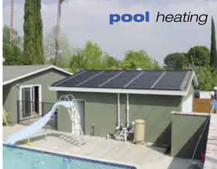
Roof-mounted solar collectors for pool heating are unobtrusive and a highly effective use of space.

compared to copper tube collectors. The large wetted surface area compensates for polypropylene's reduced heat transfer properties (the thermal conductivity of polypropylene is significantly less than copper).