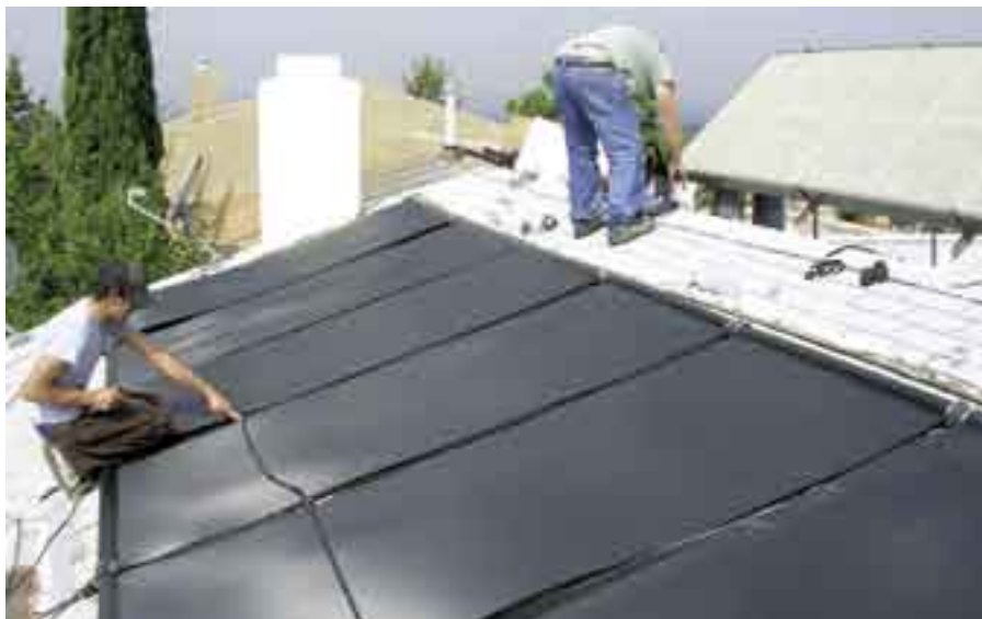
Don Keefe and Jason Urias of AAA Solar in Albuquerque, New Mexico, install a pool system. Note the strapping that secures the collectors to the roof.

Whenever there is enough heat in the collectors to add heat to the pool, the valve is actuated. If not, the valve returns the pool piping to its original configuration for filtering the pool without adding heat.